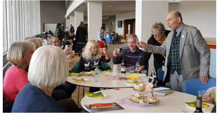
Cheers to St Piran!