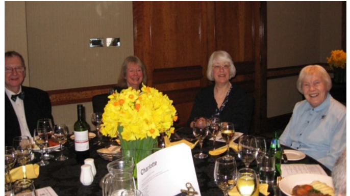
Stunning daffodils gave a Cornish 'feel' to the event

At the end of this very successful and happy event, guests left with bunches of beautiful Cornish daffodils. The daffodils were kindly donated, once again, by Cornish growers Tregothnan, Caerhays and Fentongollan. We thank them for their continued support and offer more thanks to Tregothnan for sending us some Cornish tea which proved very popular.