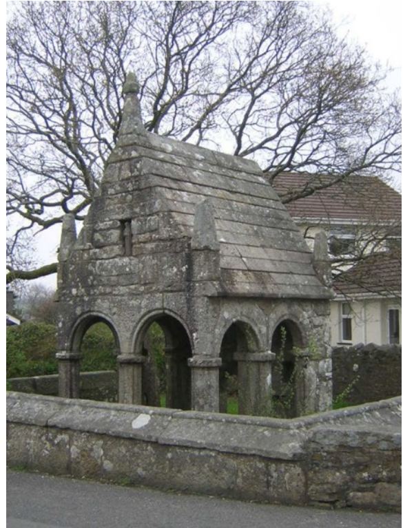
St Cleer Well

The water from this well is reputed to cure madness, rickets and epilepsy.