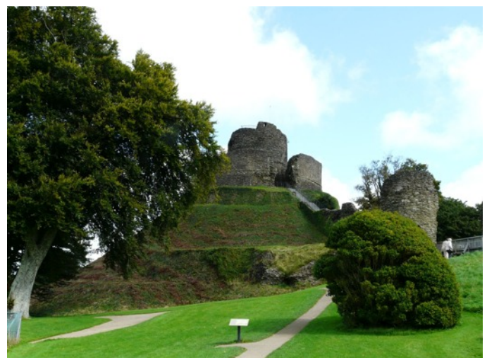
Launceston Castle which was built by Brian of Brittany, the Breton knight who became the first Earl of Cornwall