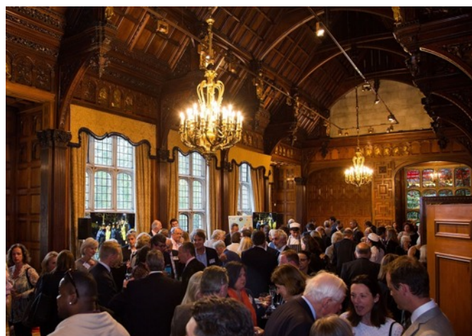
Guests at the Cornwall Club membership launch in the beautiful surroundings of Two Temple Place, London